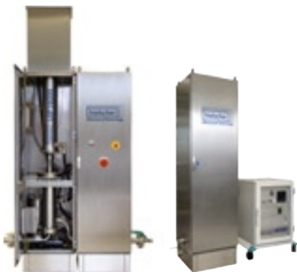
ultrasonic dispersing systems