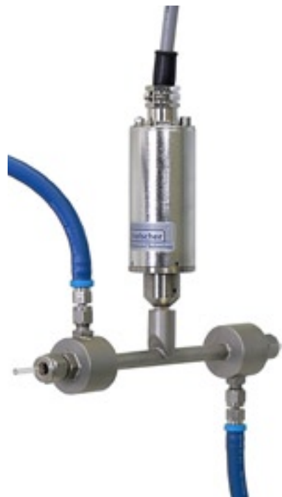
contamination free flow cell Dmini

The compact stainless steel housing of the transducer in IP64 grade withstands dust, dirt, higher temperatures and humidity. Hence, the transducer can be installed in demanding environments. It is available in explosion-proof (dust, gas) design, too. The generator, supplied in a standard housing or as top hat rail unit for an electrical cabinet, can be located outside the hazardous area. The oscillation decoupling flange of the transducer permits accurate positioning when used in machines or robot arms. For the sonication of liquids at higher temperatures of up to 300°C and pressures of up to 300 atm we offer longer sonotrodes with pressure-tight flange connections.