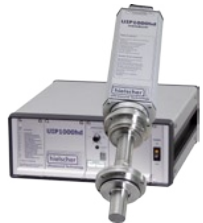
UIP1000 and sonotrode with flange

everyday production. This ultrasonic processor requires little maintenance, is easy to setup and simple to clean and to sanitize. All items are available in food-grade or pharma-grade, too. The transducer of the UIP1000 is IP65 grade, so that it can be installed in demanding environments (dirt, dust, moisture, outside operation etc.), while the generator can be placed remotely in another area.