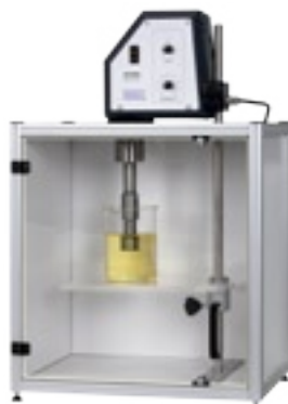
ultrasonic laboratory processors