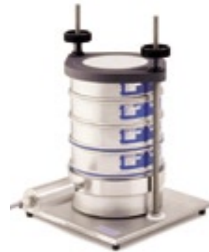
UIS250L at lab sieve tower

Please ask for our detailed sieving information for laboratories or industries.