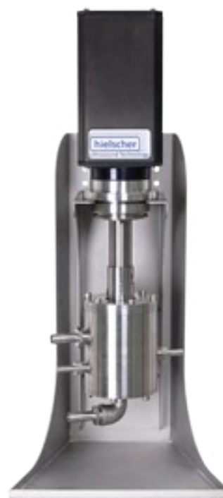
UIP500 with flow cell at stand

As a result of outstanding energy efficiency of (>80%) of the UIP500 the ultrasonic power is really transmitted into the liquid. For the processing of larger quantities, we recommend using the devices UIP1000 to UIP16000 (see next pages).