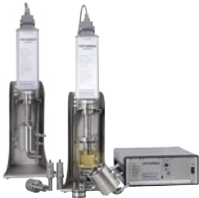
UIP1000 with accessories

The UIP1000 (1,000 watts, 20kHz) is a powerful and adaptable ultrasonic device for lab testing and industrial processing of liquids. Its is used for applications, such as emulsifying, dispersing & particle fine milling, extraction & lysis or homogenizing.