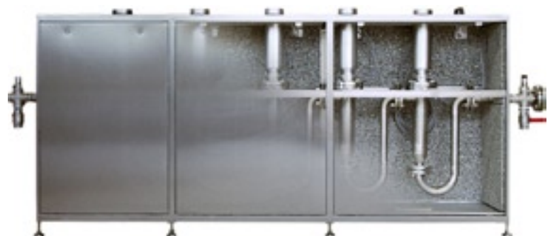
10kW ultrasonic flow system/sound protection (5 x UIP2000)