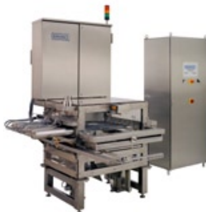
ultrasonic cutting system (8 blades)

The ultrasonic processors UIC100, UIC400, UIC500 and UIC1000 with a power of 100, 400, 500 or 1000 watts, respectively, are designed especially for cutting tasks. This cutting method is nowadays a proven technique, in particular for cutting plastic sheets, textiles, cardboards, rubber, plastics and food. In general ultrasonic cutting means the excitation of a cutting tool or of the counter-bearing. The main advantage is the significant better cutting quality. Lower feed force permit higher cutting speed. Sludge cakings at the blades are removed by the ultrasonic oscillations. The lower wear of the tools and the resulting longer durability have a cost-saving effect.