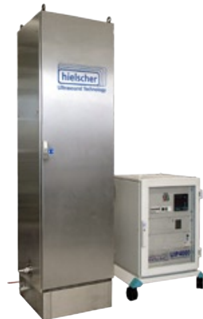
UIP4000 with flow cell/sound protection

The UIP4000 (4,000 watts, 20kHz) is used mainly for the industrial processing of liquids such as homogenizing, dispersing, disintegrating or deagglomerating.