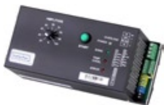
UIS250I generator in top hat rail case

The ultrasonic processor UIS250I (250 watts, 24kHz) is an ultrasonic device for special applications. It can be used to drive special flow cells (right picture), to agitate screens or other structures, to clean sensors, or as an integrated ultrasonic probe in various systems.