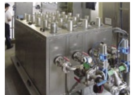
48kW flow system (24 x UIP2000)