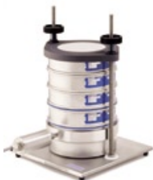
ultrasonic sieving in the laboratory