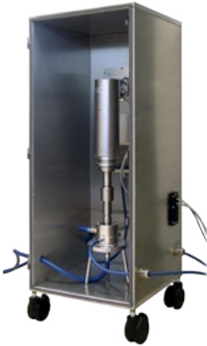
UIP2000 with flow cell/sound protection

Despite the enormous power of the ultrasonic processor UIP2000 (2000 watts, 20kHz), the device does not need any additional cooling by water or compressed air. The device works continuously in air. The robust design of the transducer, made of stainless steel and titanium, enables use under extreme conditions of dust, dirt, higher temperatures and humidity. The transducer and in special cases also the generator can be designed as ex-proof versions. According to the