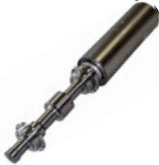
UIP2000 and sonotrode with flange

Despite the enormous power of the ultrasonic processor UIP2000 (2000 watts, 20kHz), the device does not need any additional cooling by water or compressed air. The device works continuously in air. The robust design of the transducer, made of stainless steel and titanium, enables use under extreme conditions of dust, dirt, higher temperatures and humidity. The transducer and in special cases also the generator can be designed as ex-proof versions. According to the