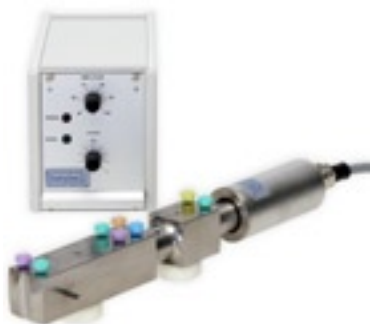
sonication of closed vials