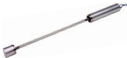
UIC1000LB with long blade (800mm)