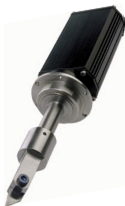
UIC400 with short blade

Exchangeable blades, which are selected to the cutting criteria of the respective application case such as the material, shape and length, are used as tools. The ultrasonic processors can also be constructed for the use in the food industry.