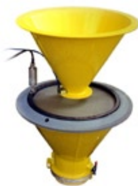
industrial ultrasonic sieving