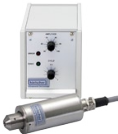
ultrasonic processor UIS250I