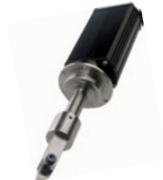
cutting and welding