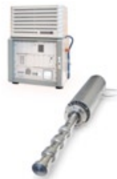
ultrasonic industry processors