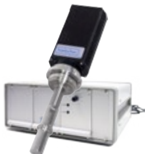
ultrasonic processor UIP500

The ultrasonic processor UIP500 (500 watts, 20kHz) is an industrial grade device that is being used mainly for process development and for the bench-top scale processing of liquids. When applied to liquids, low frequency, high power ultrasound generates intense cavitation. The cavitation effects can be used for various processes, such as: emulsifying, dispersing, homogenizing, cell disintegration and extraction as well as for the degassing of liquids.