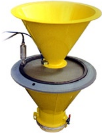
UIS250I at sieve frame

Besides the classical low frequency vibrators, the use of ultrasonics has proven particularly efficient for the sieving. This technique accelerates the process or, in cases of difficult material, renders it possible at all.