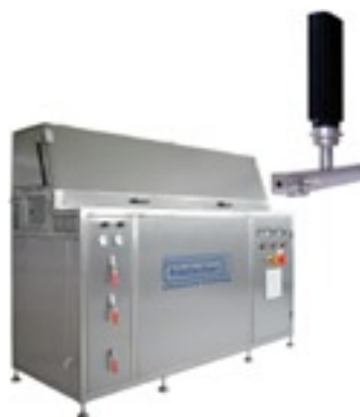
wire-, tape- and profile cleaning